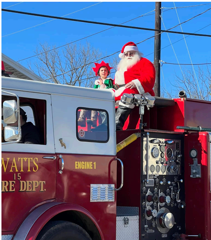
Santa got a special ride in the Watts parade.

On Saturday, December 9, at 1 pm, under partly cloudy skies and a brisk southern breeze providing a balmy temperature, parade participants gathered at the Watts High School parking lot to get their spot in the Annual Watts Christmas Parade. I filmed the procession from my place near the Town Clerk's office and you too can enjoy it by clicking on the QR Code below. Merry Christmas to the unique town of Watts!