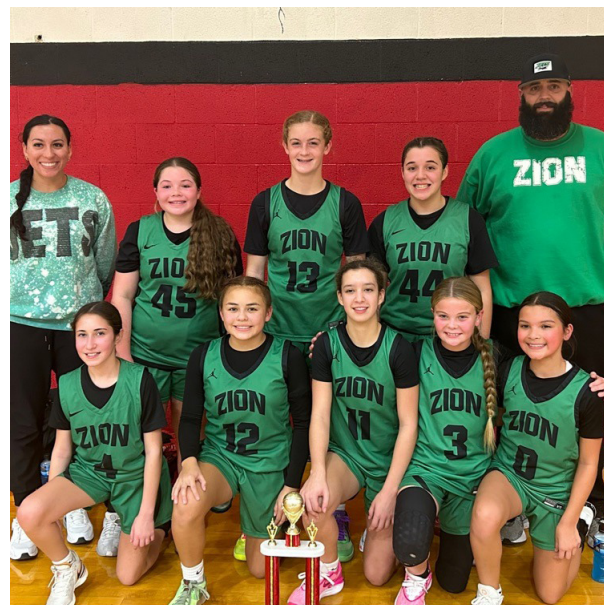
Congratulations to our Lady Jets on placing first in the Stilwell 7th Grade Tournament!