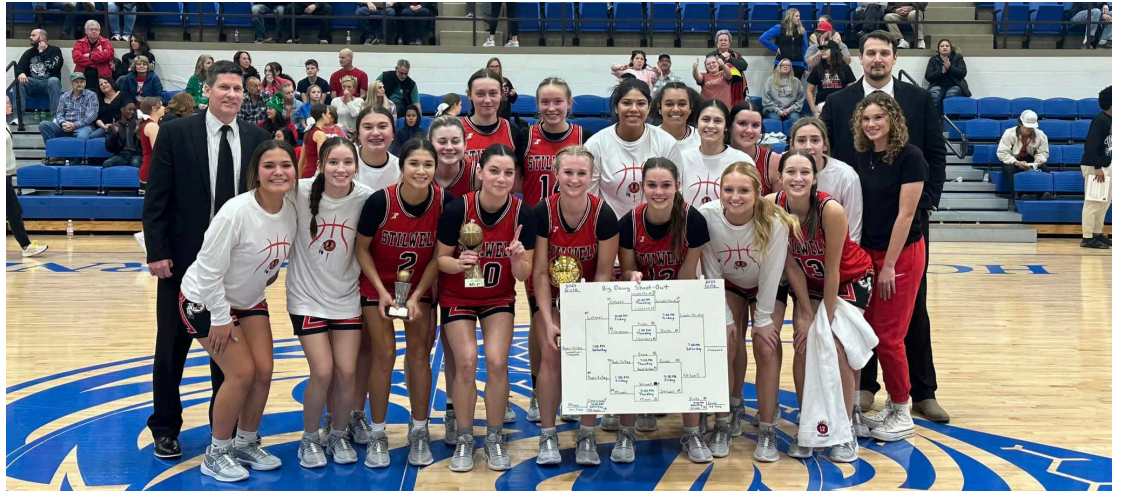
Congratulations to our Lady Indians!! Big Dawg Shoot-Out CHAMPIONS!!! (2023 Vinita Tournament)

plicate the Girls' achievement, the table was set to take home a dual championship. The Indians had played their way into the finals by defeating Grove in the first round, 46-32. In their next game, the Indians again won by a margin of 14 when they defeated Lincoln Christian 54-40. The Pauls' Valley game would prove to be a nail-biter. This game would go down to the wire with Pauls Valley coming out on top 40-38. Taking home a second place trophy is still a noteworthy achievement and something of which to be proud. The Indians are now 3-2 on the year. Something else which is noteworthy: the Indians' 2 losses are by a combined 5 points. A splendid season awaits both the Lady Indians and the Indians. More excitement in store!