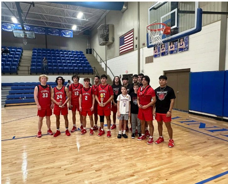
Congratulations to our Stilwell Indians winning Runner-Up in the Big Dawg Shoot-Out 2023 Vinita Tournament! Great job guys!! We are so proud of you!

Stilwell Indian Athletics photos from Facebook