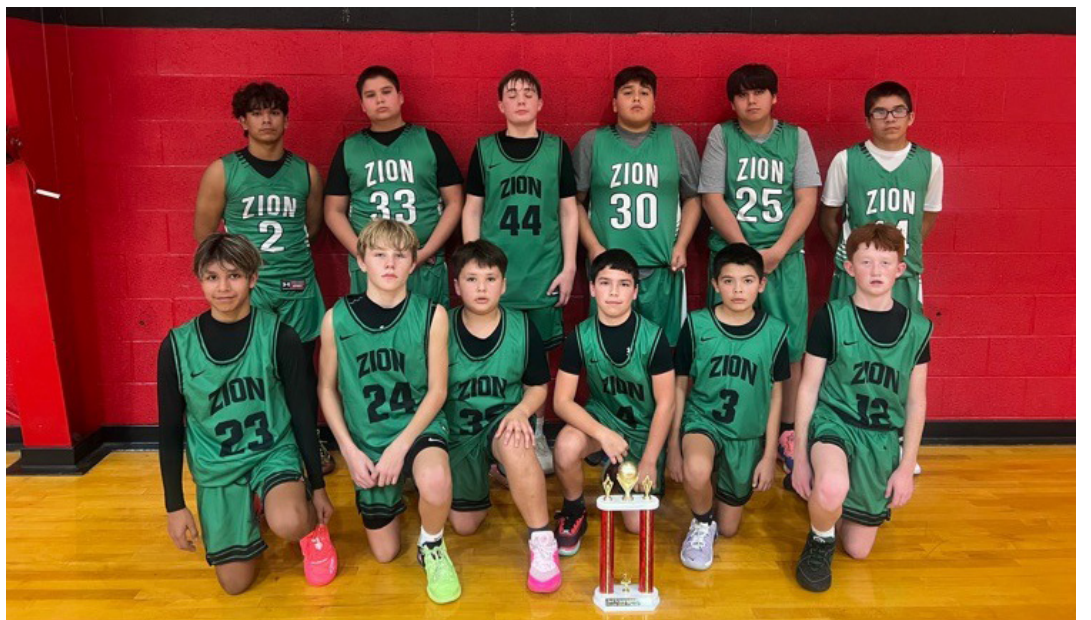
Congratulations to our Zion Jets! They placed 2nd in the Stilwell 7th Grade Tournament!