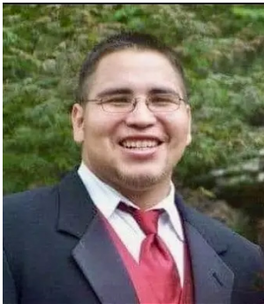
Chooge September 22, 1984 - December 2, 2023