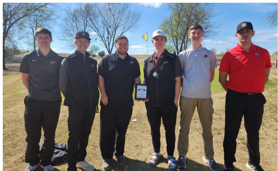
Stilwell Indian Athletics Facebook