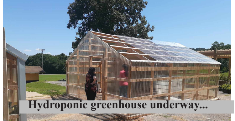
Hydroponic greenhouse underway...