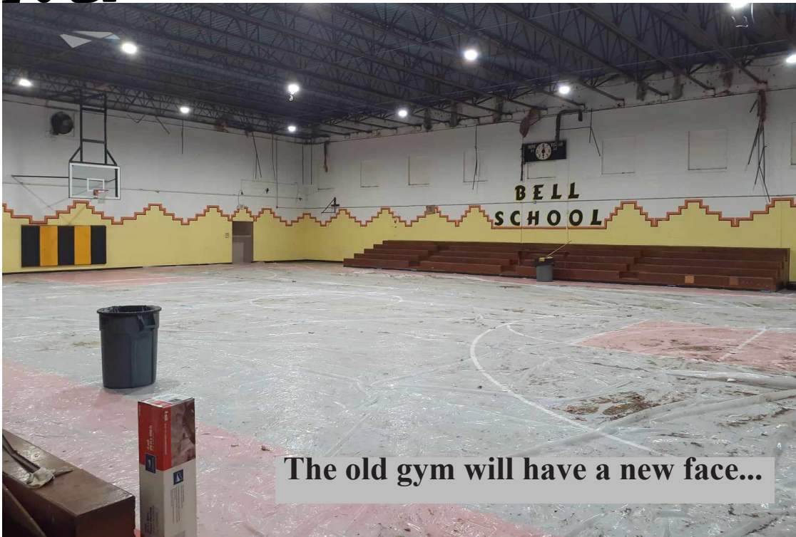
The old gym will have a new face...