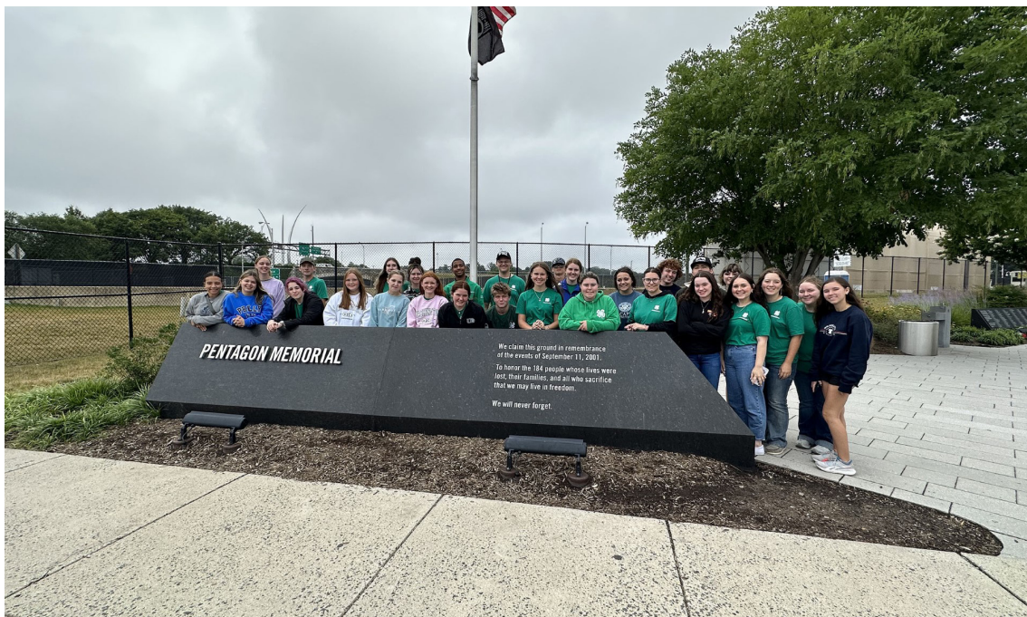
Oklahoma 4-H'ers attending the Citizenship Washington Focus stop for a photo opportunity at the Pentagon Memorial. Story on page 4.