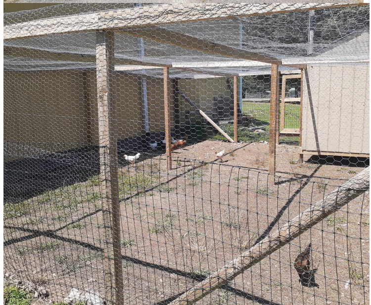
Chicken coop the students built...