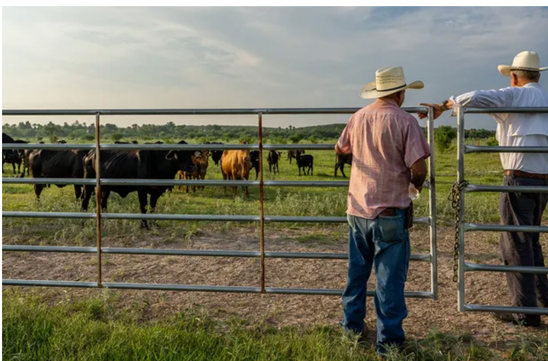
Sens. Eric Schmitt, R-Mo., and Markwayne Mullin, R-Okla., warn that a drought forcing Midwest farmers to trim their herds and work with minimal water and feed could cause U.S. food prices to spike.