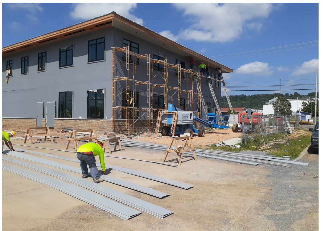
City Hall... workers climbing tall upon the wall...on a hot Summer day...